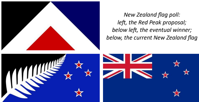
New Zealand flag poll: left, the Red Peak proposal; below left, the eventual winner; below, the current New Zealand flag

The power and influence of graphic designers is on the rise, and they will undoubtedly be involved in more flag design processes in the future.