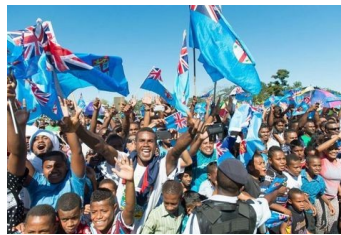
Left, a 12-year-old Fijian boy runs half a mile through canefields to watch the 2016 Olympic Rugby Sevens final on the nearest TV set. Right, homecoming of the victorious Fijian team.