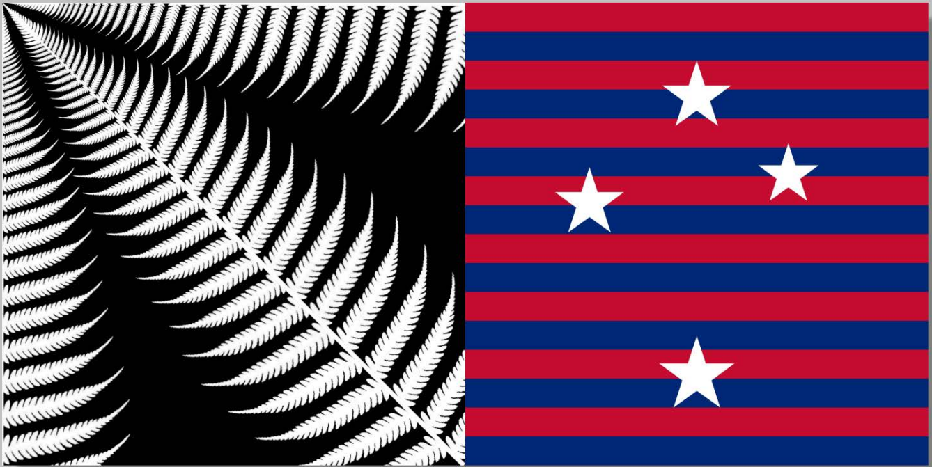
Naval ships ensign